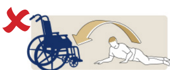
Floor to Bed/Chair