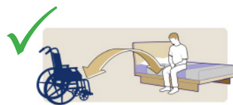
Bed to Chair/Chair to Bed (From/to seated position)