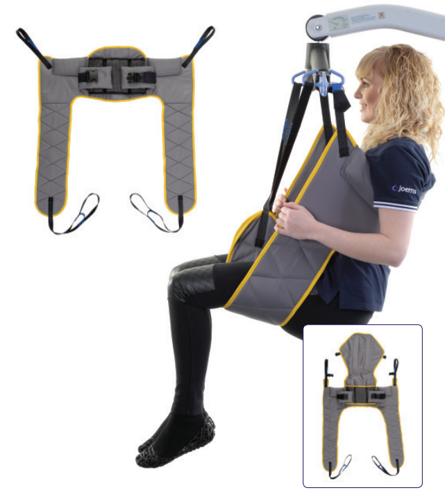
WITH HEAD SUPPORT