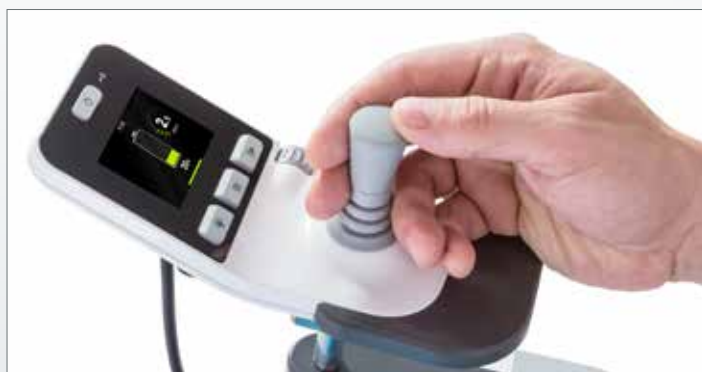
Informative colour display and user-friendly control elements