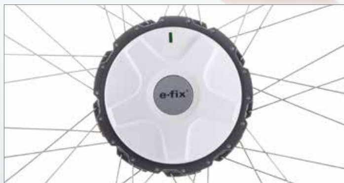
Compact, light, powerful: the e-fix drive unit