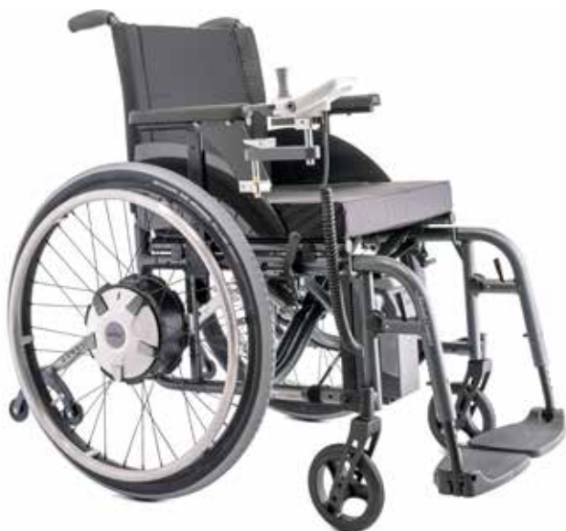
e-fix E36: powerful drive wheels with more power (optional)