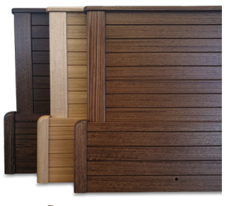
Burnt Walnut Beech Saddle