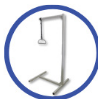
SELF HELP POLE